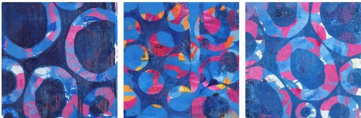
Dash Fund: Dreams