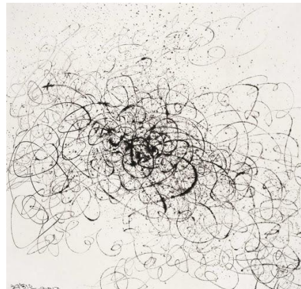
Moving Visions Series No.64, 2012